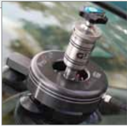
G3 Standard Plus System

◀ Save time on every repair with the ProCur2™ LED UV Curing Light.