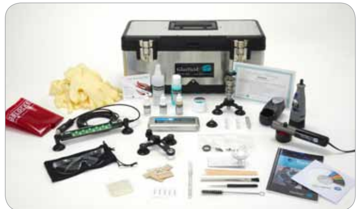
G3 Standard System shown.