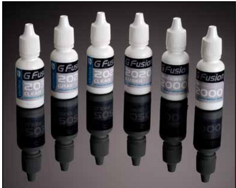
GlasWeld's Gfusion resins deliver consistent repair results—every time!