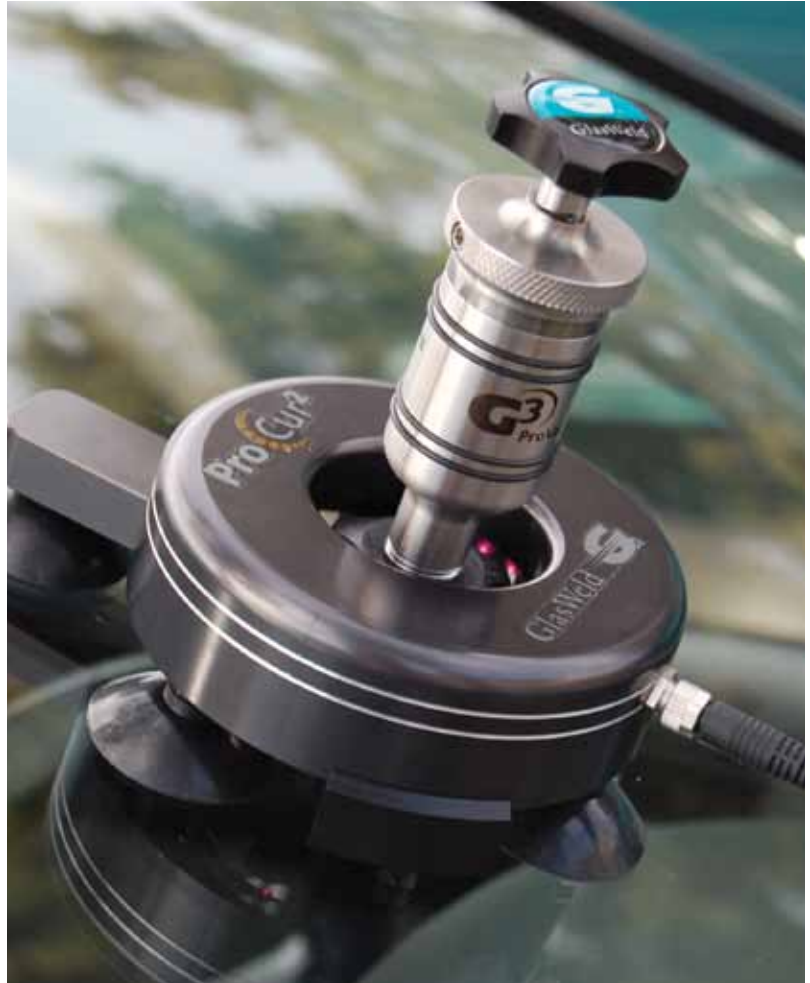
The G3 ProVac Injector and the ProCur2 LED UV Curing Light provide exceptional repair results.

When starting or expanding your business to include auto glass repair, look no further than GlasWeld. Our innovation in auto glass repair equipment, service, and training will ensure your success for years to come.