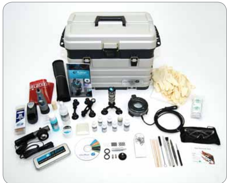
G3 Professional System