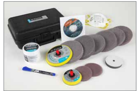
Gforce™ Glass Abrading Module