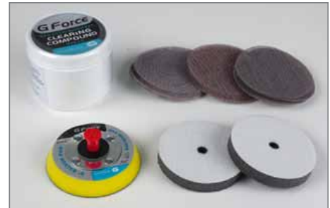
Gforce™ 3" Abrading Module