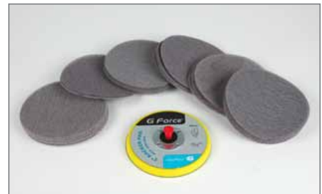
Gforce™ 5" Abrading Module